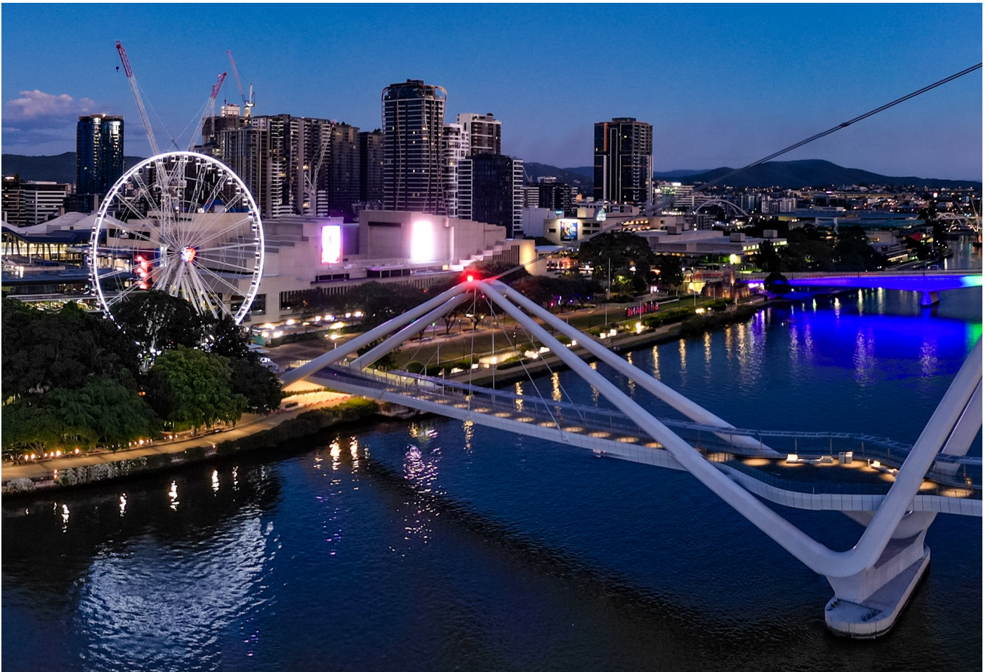
The Neville Bonner Bridge, crossing the Brisbane River, with Southbank, the Wheel of Brisbane, and the Brisbane Convention and Exhibition Centre beyond.